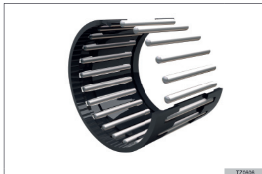
Fig.28 Single-row needle roller and cage assembly