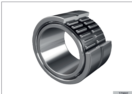
Fig.24 Double-row, massive needle roller bearing

The bearing consists of the outer ring, which is functionally connected with the cage containing needles and the detachable inner ring. Bearings with outside diameter above 19 mm have a ring groove and a lubricating hole on the outer ring. NA69-series, 55mm in diameter and above, has two rows of needles. For sealed versions the inner ring has been slightly lengthened, what substantially improves parameters of the bearing tightness.