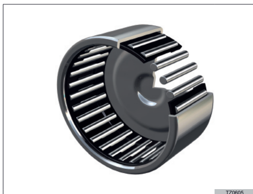
Fig.27 Thin-walled needle roller bearing, closed-end version

needle roller bearings. In contrast to other needle bearings, the thin-walled needle roller bearings have a very thin outer ring, stamped from steel sheet. The bearings in the basic-make have no inner ring. They are usually single-row bearings, except for wide 1622, 2030, 2538, 3038 bearings, which comprise two adjacent rows of needles and the lubricating hole in the outer ring (other bearings can have this hole, too). Open-end bearings are opened from both sides and closed-end bearings are closed from one side and are suited to be mounted on shaft ends. The outer ring stamped from hardened steel sheet, cage and needles form the inseparable whole. Special versions with contact seal made of polyurethane or synthetic rubber are also produced – RS or 2RS marking behind the bearing symbol. Dimensions of HK- and BK-series bearings are standardized and consistent with ISO standards. In their designation the dimensions in mm are provided in the following order: d-inside diameter, B-width, and for bearings with other dimensions one puts D-outside diameter between “d” and “B”, e.g. HK1210-standardized dimensions d=12mm B=10mm, HK071108-not standardized dimensions d=7mm d=11mm B=8mm