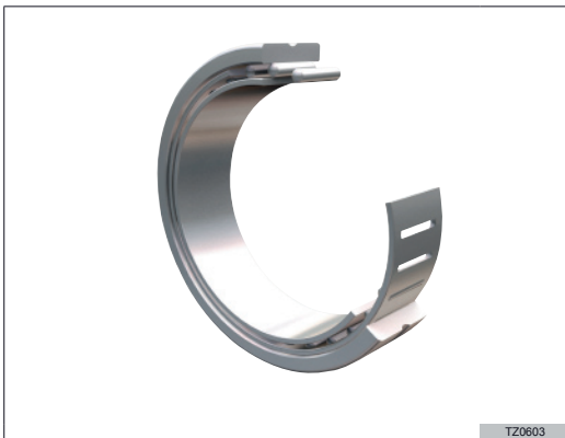
Fig.25 Massive NAO-series needle roller bearing, inner and outer ring are open-end rings

Designation of the RNAO-series without inner ring provides the rated diameter of the inscribed circle of the cage with needles (Fw) in spite of the size of the inside diameter d.