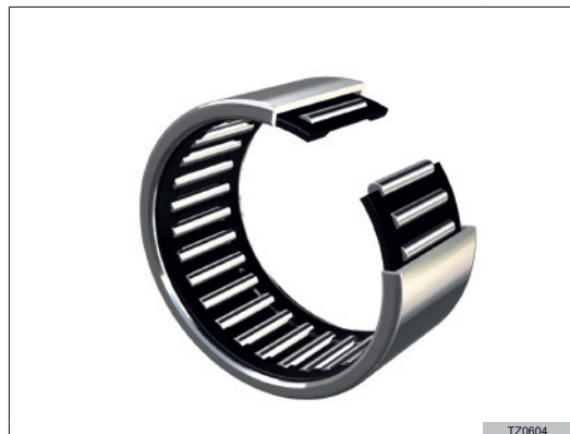
Fig.26 Thin-walled needle roller bearing, open-end version

The most diversified group of needle bearings as far as dimensions are concerned is represented by thin-walled