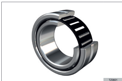
Fig.23 Single-row, massive needle roller bearing