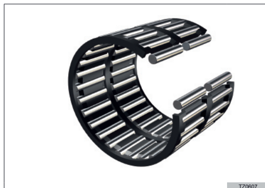
Fig.29 Double-row needle roller and cage assembly

They guarantee the smallest cross-section of the bearing -closed pairs at high load capacity from among all needle bearings. They interact directly with other machine elements but it requires keeping proper diameter tolerances